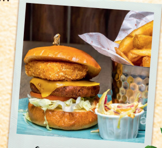
Great Valley Burger